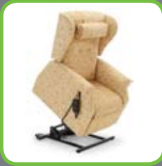
Electric Riser/ Recliner Chairs