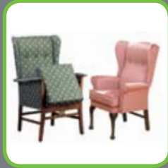
High Seat Chairs